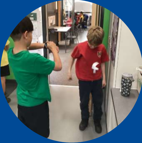
Year 5 - testing helicopters in Science